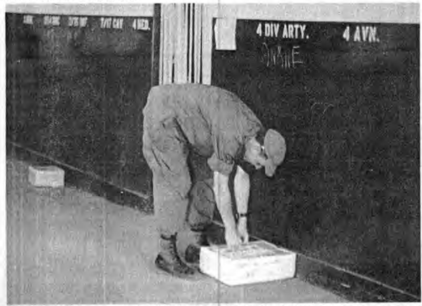
LONELY PARCEL - For a few brief, shning moments the unit mail clerks at Camp Enari seemed to soak up a good tan.