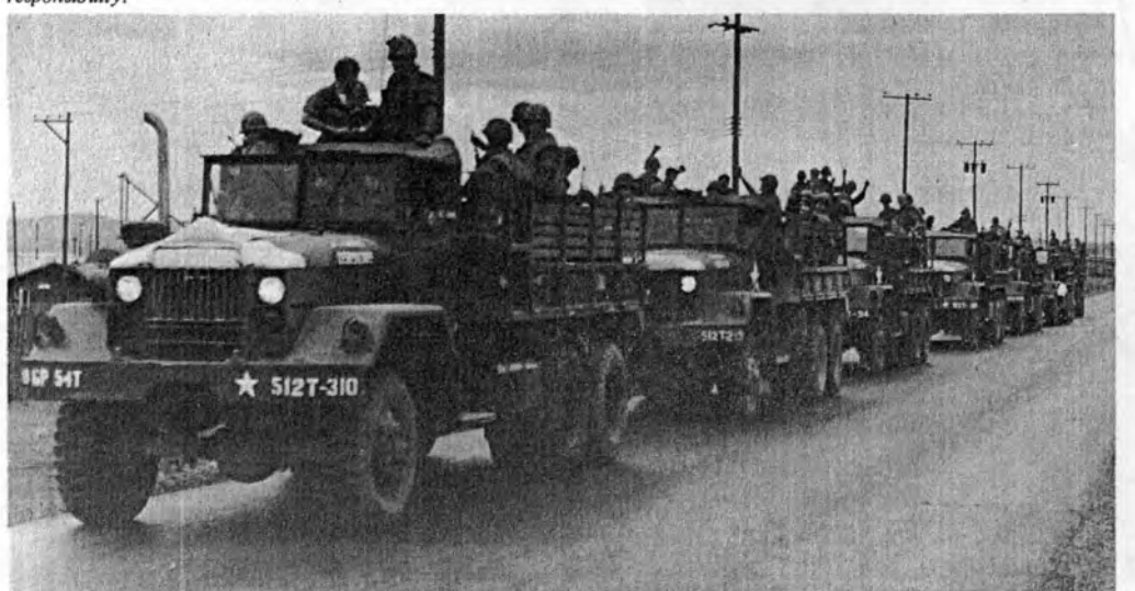
LAST RIDE -- The final unit to leave Camp Enari was the 3rd Battalion, 12th Infantry.