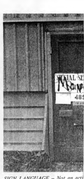
SIGN LANGUAGE - Not an acti that it is a concise expression of t