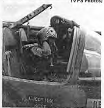
A pilot of the 524th Fighter Squadron, 62nd VNAF Wing, adjusts his flight gear before taking off in an A-37 jet attack bomber from Nha Trang Air Base.

"But we don't build aircraft or make spare parts here in Vietnam. We may progress to where we can fight the whole air war ourselves, but for a good while we will be dependent on the United States for supplies and support. And without U.S. air power in Vietnam, we would be sitting ducks for the communist MIG-21s