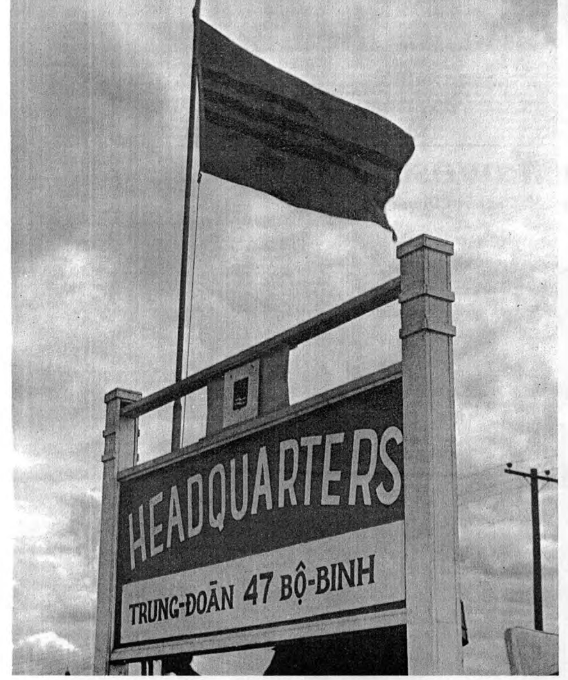
SIGN OF THE TIMES - The Vietnamese flag and a modified sign which reads "47th Infantry Regiment," concisely describe newly assumed responsibility.