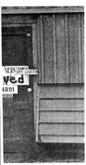
iction photo-but you can't deny if the Division's relocation.