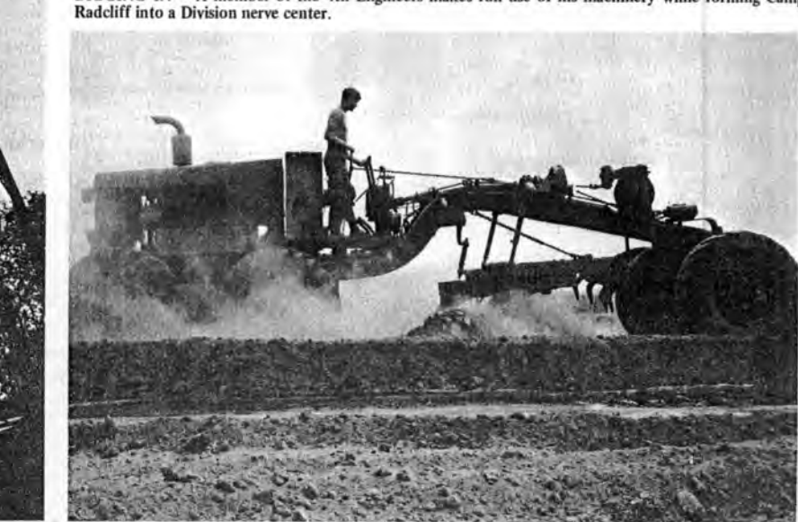
DRAGSTER -- Road graders were constantly employed by the 4th Engineers to tackle massive renovation projects.