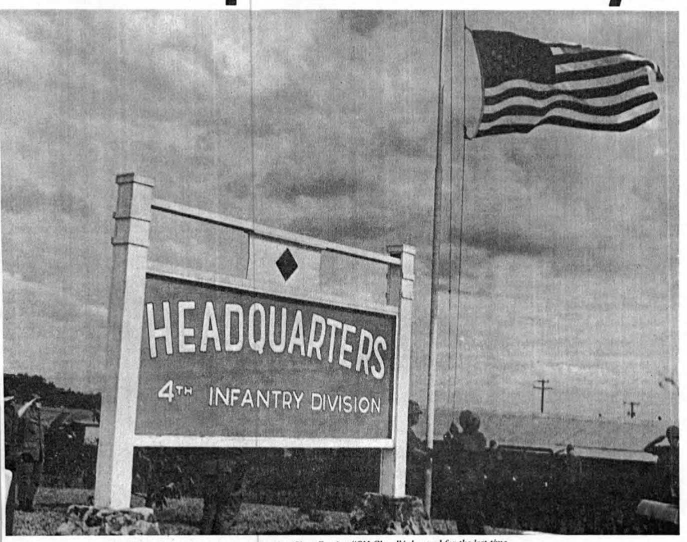
SOLEMN MOMENT -- Salutes are rendered at Camp Enari as "Old Glory" is lowered for the last time.