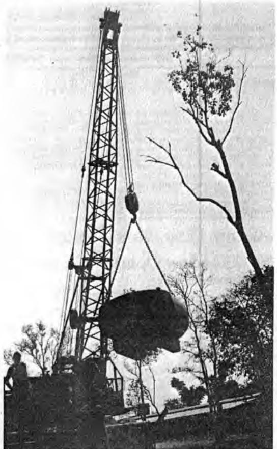
BIG LIFT - Relocation of the 4th Division's base camp necessitated the installation of several additional water tanks at Camp Radcliff.