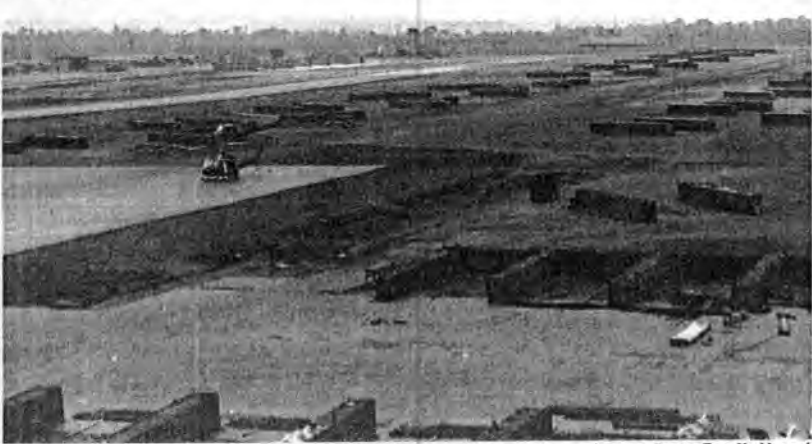
TOWER STRIKE -- It may look that way, but this was only a temporary sight at Camp Enari's Hensel Field during the latter stages of the move.