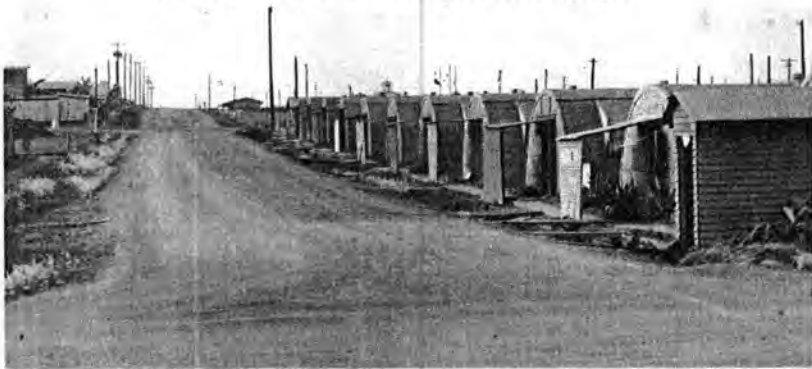
QUIET QUONSETS - This was the scene at Camp Enari during the period of transition, after most of the staff sections had moved out.