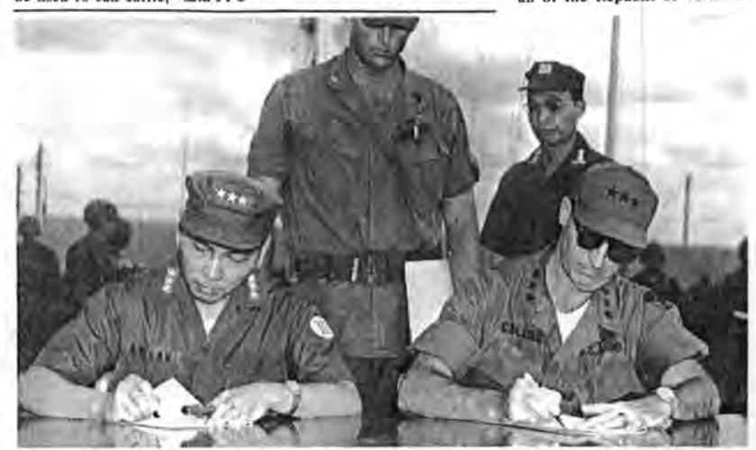
HISTORIC SITTING - Lieutenant General Lu Lan and Lieutenant General Collins sign the documents (Vietnamese and English) which effected the turnover of Camp Enari.

It was in late July, 1966 that the 4th Engineer Battalion arrived at the site, located 10 miles south of Pleiku City, and began to build what to this day is still considered one of the most functional base camps in all of the Republic of Vietnam.